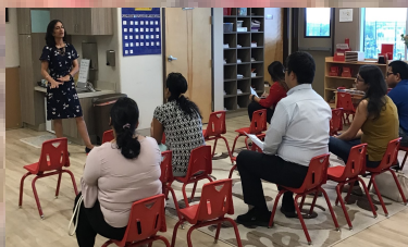
Back To School Night